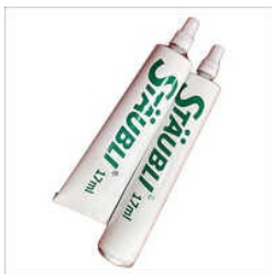
OPHTHALMIC NOZZLE ALUMINUM COLLAPSIBLE TUBES

Aluminum Collapsible Tubes, Aluminum Cylindrical Collapsible Tubes, Black Plastic Tubes, Cream Laminated tubes, Cream laminate tube, Laminated Empty Toothpaste Tubes, Laminated Face Wash Tubes, Laminated Shave Gel Tubes, Laminated Tubes, Multi Colored Face Wash Tube, Ophthalmic Nozzle Aluminum Collapsible Tubes, Ophthalmic Nozzle Tubes, Plastic Cosmetic Tubes, etc.