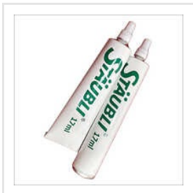
Ophthalmic Nozzle Aluminum Collapsible