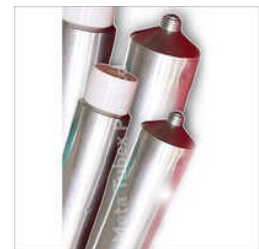
ALUMINUM COLLAPSIBLE TUBES