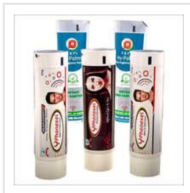
Laminated Face Wash Tubes