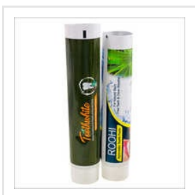
Laminated Empty Toothpaste Tubes