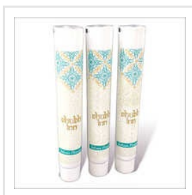
Plastic Cosmetic Tubes