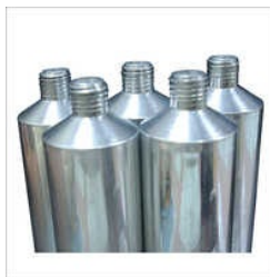
ALUMINUM CYLINDRICAL COLLAPSIBLE TUBES