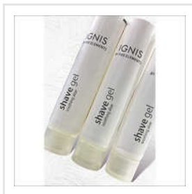
Laminated Shave Gel Tubes