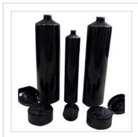
Black Plastic Tubes