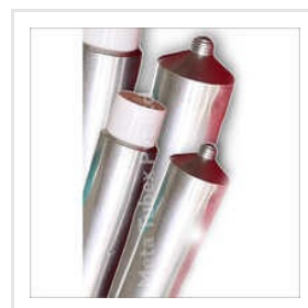
Aluminum Collapsible Tubes