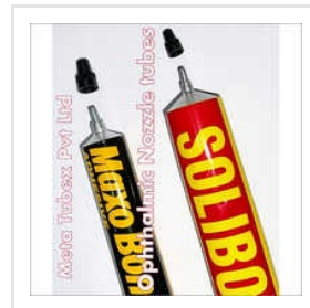
Ophthalmic Nozzle Tubes