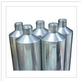
Aluminum Cylindrical Collapsible Tubes