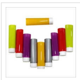
Multi Colored Face Wash Tube